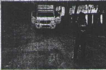
मूलाघाट के बसीड़ गांव तक पहुंचे वाहन।

क्षेत्र के जोर गांव, त्याना, भरइखेत, सननखेत, पंथुड़ी, बसीड़, तडीगांव, बलतडी, पीपलतडा आदि गांवों के लोगों ने खुशी व्यक्त की है।