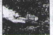
पूर्णेश्वर लिफ्ट पेयजल योजना के ट्रायल में निकला पानी।